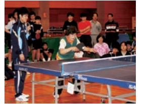
Table tennis course

In the more than 40 years since its founding, the table tennis club at Citizen Holdings has held table tennis courses and training sessions all across Japan, from Hokkaido to Okinawa. In fiscal 2007, the club held a total of 14 sessions for 1,990 participants in eight prefectures. The club members also communicate with the people of the community through an array of activities, including appearances on local radio stations and West Tokyo F.M. Broadcasting.