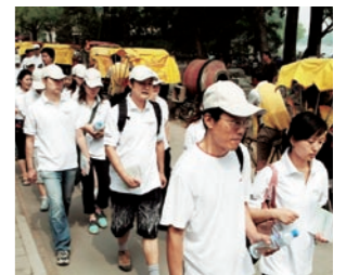
Beijing walking event

Citizen Watch (China) Co., Ltd., is holding discussions among its employees, asking what everyday citizens can do to protect the environment and encouraging them to walk whenever possible instead of using cars. In July 2007, the company also held an event in which employee volunteers walked around Beijing, in hopes that such a healthy practice would become a grassroots movement involving many people. While walking around the city, the volunteers passed out pamphlets explaining the Group business philosophy, product creation policy and thoughts on environmental protection to spread interest in this movement.