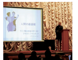
Speech contest in Moscow

The Moscow resident office of Citizen Watch has cosponsored awards for participants and winners of the CIS Student Japanese Speech Contest held by the Japanese Embassy and the CIS Japanese Language Teachers Association every year since 2005 in Moscow for Russian students studying Japanese.