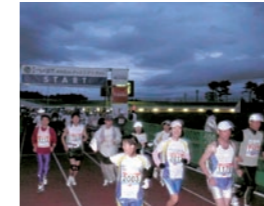
At the starting line

Citizen Tohoku Co., Ltd., cosponsors the Iwate Ginga 100km Challenge Marathon held every year in Iwate Prefecture. We cosponsored this event in fiscal 2007 as part of the celebration of the 150th anniversary of Baron Shimpei Goto, who gave Citizen its company name. Citizen employees also helped with event operations at the finish line as volunteer staff.