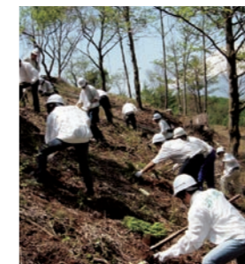
Plant One Million Trees campaign

In fiscal 2007, 23 employees at the company—including new recruits—helped plant Japanese cypresses as part of tree-planting activities in the forests of Oshino Village.