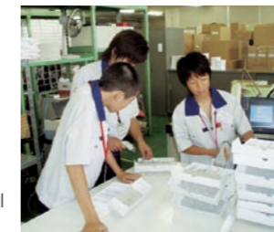
Student work experience

In fiscal 2007, Citizen Holdings and Citizen Watch welcomed students from nearby junior high schools to attend Watch School and experience working at a watch distribution center. Since fiscal 2006, we have also held two-day parent-child study sessions every summer vacation. More than 100 elementary school students and their parents participated in the fiscal 2007 event, which included a tour of our watch and clock archives and a sundial creation project.