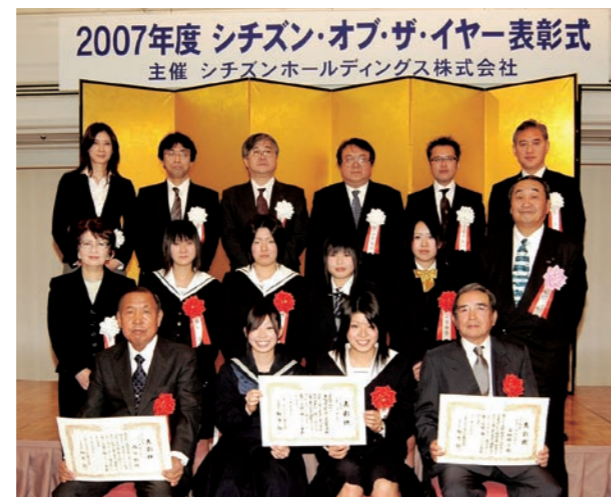
Award ceremony for the Fiscal 2007 Citizen of the Year