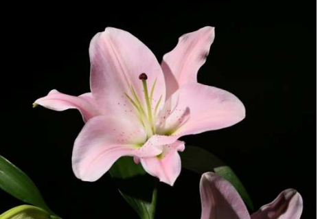
CITILED Vivid Series Brilliant Type