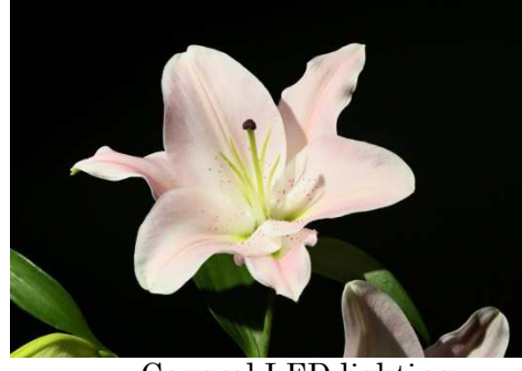
General LED lighting