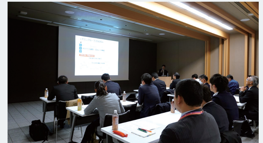
A briefing for suppliers

In addition, to further raise awareness of the importance of sustainable procurement, we also carried out educational activities led by the secretariat to help the concept permeate further among officers and sections responsible at Group companies. At overseas production facilities and other